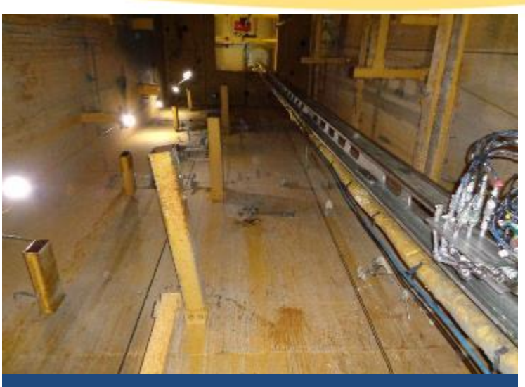
Extraction Cell 1 before and after stabilization (fixative)

First manned entry into Extraction Cell 1 to confirm radiological conditions and commence stabilization