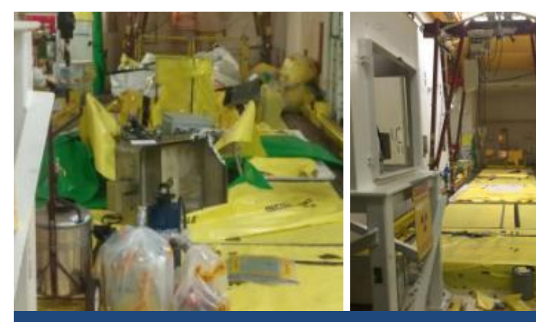
XCR during and after cleanup