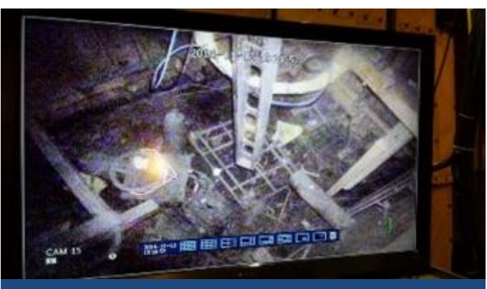
Extraction Cell-1 Before Deactivation