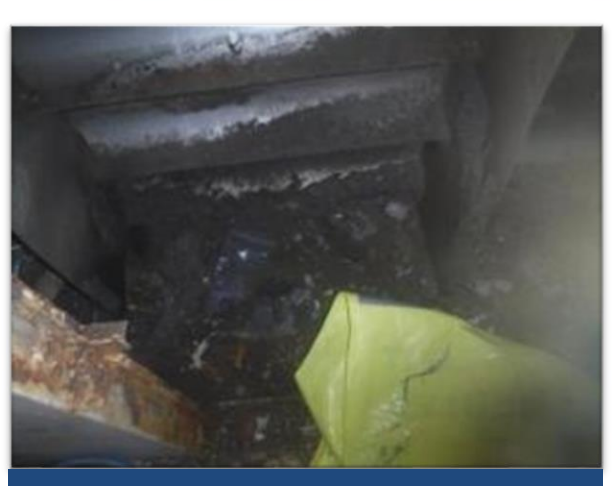
Vent Exhaust Cell Filter Room before and after fixative