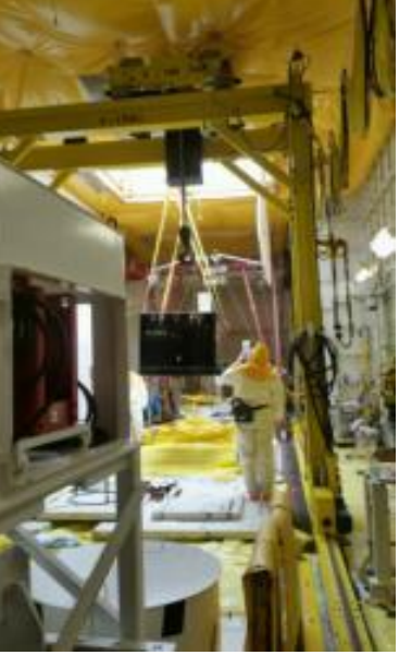
Liquid Waste Cell hatch removal and view of cell after hatch cut