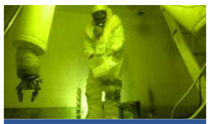
Sample Storage Cell manned entry for decontamination