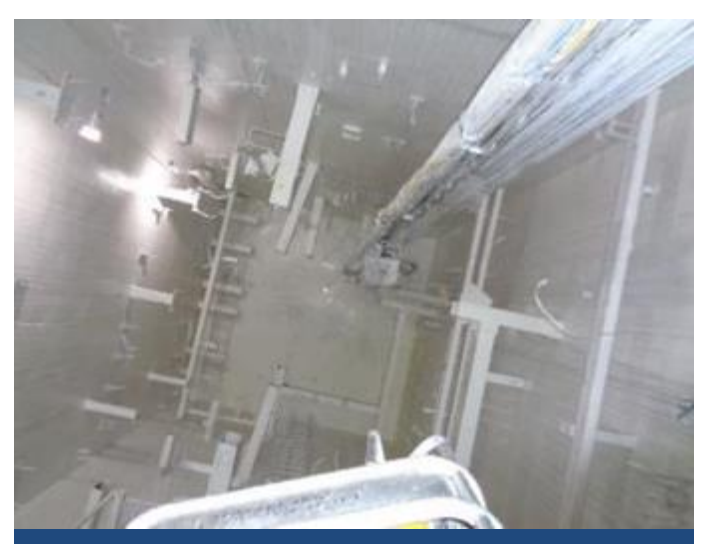
Extraction Cell-1 After Deactivation